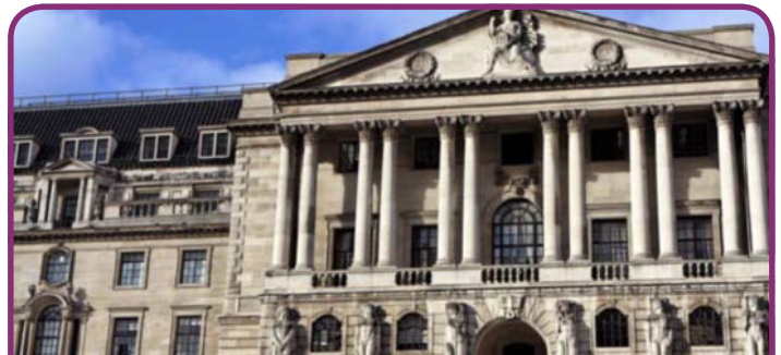
The Bank of England influences mortgage interest rates

Your home may be repossessed if you do not keep up the repayments on your mortgage. A fee may apply for mortgage advice and you must ask for details before making any decision relating to a new mortgage as the actual amount will depend on your personal circumstances, but in most cases is unlikely to exceed 0.5% of the loan value (on a typical £100,000 mortgage, this would be £500).