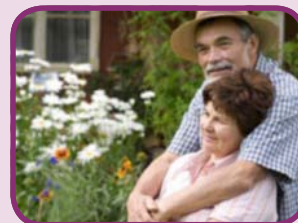
Living to 100 and beyond ...