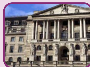
Is now the time to re-mortgage?