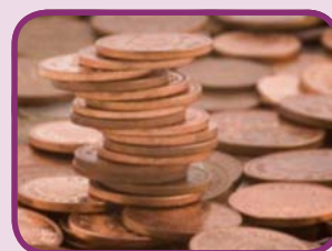
The impact of inflation on savings