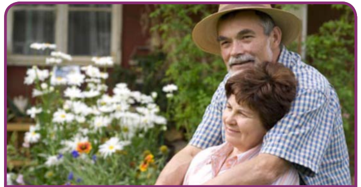
Will eighty be the new sixty?

The key issue for most of us, especially those who are already