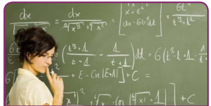
Not always the best way to communicate

According to Professor Stephen Hawking, adding one equation to his book would halve sales. It is therefore with some trepidation that we include some statistics in this article. On the other hand, few people reading financial articles are likely to share the 'popular' fear (even ignorance) of statistics, and their use can make things much clearer.