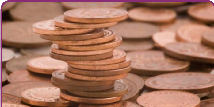
A mismatch between interest rates and inflation

Even if interest rates rise throughout 2011, it is unlikely that they will rise high enough for savers to achieve a positive return, in real terms, any time soon.