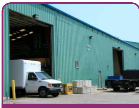
A focus on growing the private sector

The aim of this Budget was to help the UK recover its position as a manufacturing country.